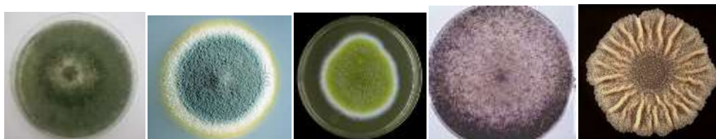
Figure 1. Microbial contaminants in oyster mushroom cultivation

The microbes that damage the growing media for fungi are mostly fungi and bacteria in addition to various types of pest animals such as sciarid fungus flies, phorids, fungal mites, red pepper mites, small fungal mites, and porous (Christita and Suryawan, 2018). Several types of fungi and bacteria that are often found as contaminants that can reduce production by 30-50% are Trichoderma , Penicillium , Aspergillus flavus , Rhizopus , and Bacillus subtilis with colonic characteristics shown in Figure 1 (Sietalab, 2019).