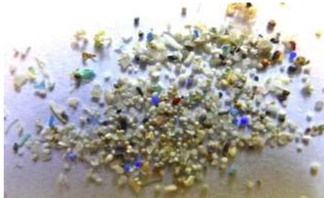
Picture 1 : particle sof micro plastick as pollutan in the marine environment