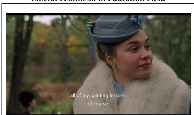
Table 1.5 Verbal and Non-Verbal Signs of Liberal Feminism in Education Field