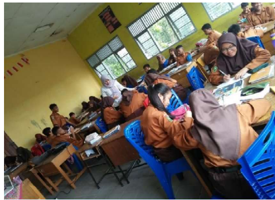
Figure 1. The learning process in the experimental class

In the experimental class, the PBL model is used to facilitate the learning process, and at each meeting, each student receives a Student Worksheet (LKPD) that directs them to answer problems using the PBL model and KPMM phases. The PBL approach used in the experimental class encourages students to actively solve mathematics problems offered in the LKPD in groups as part of the learning process. In the control class, students got all materials straight from the teacher. In the control class, students got all materials straight from the teacher. As for the learning process in the experimental class and control class can be seen in the picture below.