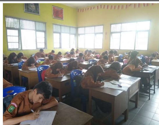
Figure 2. The learning process in the control class

At the student introduction to difficulties level, students have the chance to comprehend the challenges provided in the LKPD. At the stage of organizing students to learn, students are