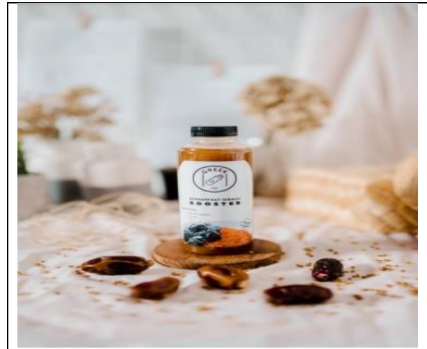
Figure 1. Beverage Products

The prolactin hormone levels in the intervention and control groups were measured on the 15th day, namely, after the intervention, which was carried out in the morning. Table 2 showed that the difference in the average level of the hormone prolactin of the intervention group given drinks combination of Fenugreek seeds and Phoenix dactylifera was higher than the control group given drinks of Phoenix dactylifera only (Intervention: 279.52 ng/ml, Control: 263.31 ng/ml), but based on the results of the Mann Whitney test obtained insignificant ( p > 0.05 ).