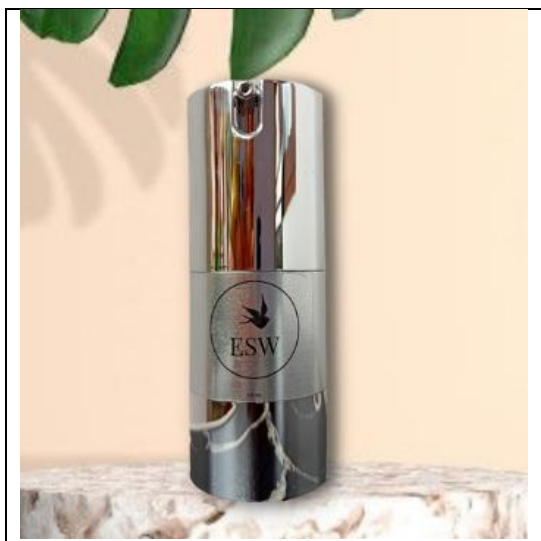
Figure 1. A Swallow's Nest Extract Gel Product