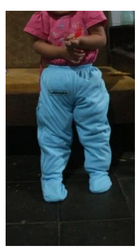
Figure 2. The use of therapeutic pants in a child with genu varum