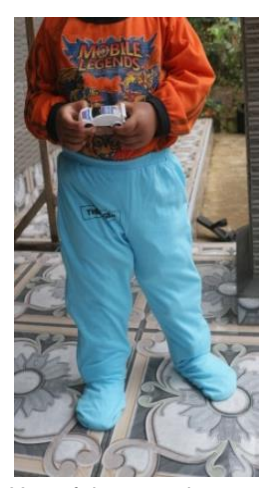
Figure 3. Use of therapeutic pants in a child with genu valgum

The results of this therapeutic pants product development are proven to provide comfort when children with genu varum and genu valgum are mobilizing daily. For mothers who have children with the feet disorders, they are expected to use this product for their children as a medical