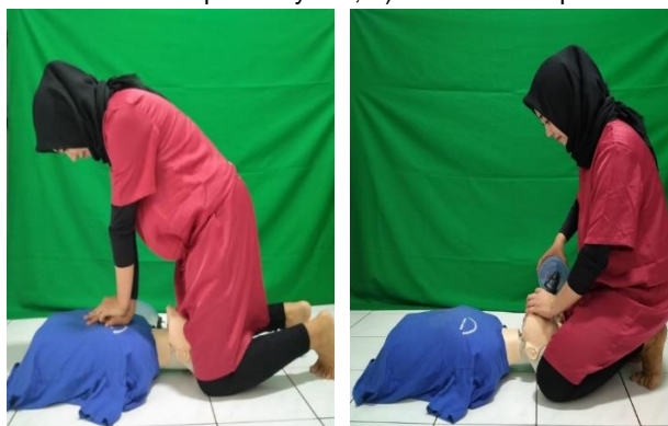
Figure 1. Over the Head position CPR

The steps of over the head position technique CPR is 1). The rescuer positions him/herself over the patient's head; 2). The rescuer's knees are between patient's head, as shown in (Figure 1); 3). The rescuer's hands are in the lower half of the patient's sternum; 4). The rescuer performs chest compression movements first; 5). Perform chest compression with up to 5 cm depth; 6). Perform chest compressions with a speed of 100-120 x / minute; 7). CPR has carried out as many as five cycles with a compression ratio: 30: 2 ventilation or 30 compressions then continued with two times ventilations followed by 30 more compressions and so on up to 5 cycles; 8). The rescuer performs