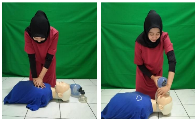
Figure 2. Lateral Position CPR

The steps of lateral CPR are similar to the over the head position CPR except for the CPR position. The rescuer's position him/herself next to the patient, as shown in (Figure 2).